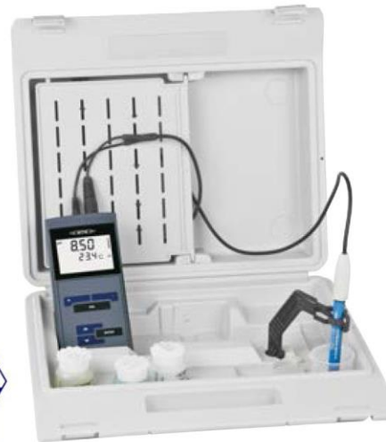
Set in case