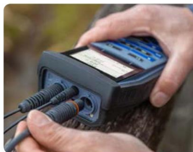
With waterproof mini USB-B interface for up-to-date data transfer.