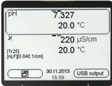
Display with two measured values