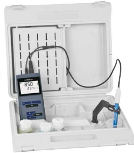
Set in case

For more detailed information please order free of charge our catalog "Lab and Field Instrumentation" or visit our web site : www.wtw.de/en/produkte/labor (For convenience use our QR code).