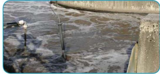
In the aeration: calibration free FDO 700 IQ.F for dissolved oxygen