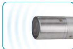
Ultrasonic cleaning for turbidity