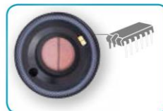
Calibration free D.O. sensor cap