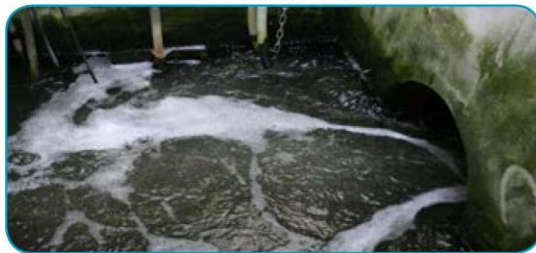
In the outlet: VisoTurb® 700 IQ.F turbidity sensor with ultrasonic cleaning