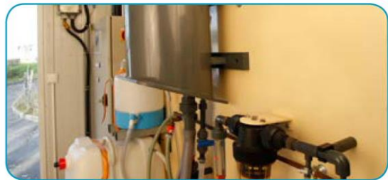
In the process: TetraCon® 700 IQ.F 4 electrodes conductivity cell