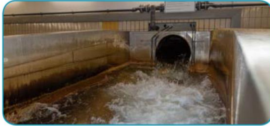
In drinking water: SensoLyt® 700 IQ.F for different pH ranges

Developed for wastewater, successfully in drinking water and process for years: The robust products of WTW are made for any application. Try it yourself!