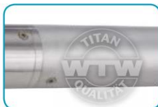
Robust technique by titanium shaft