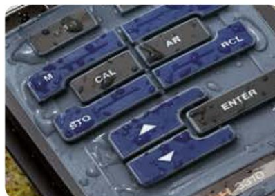
Robust sealed silicone keypad - 100% waterproof