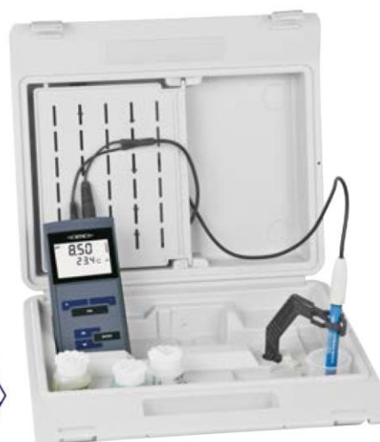
Set in case