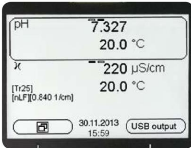
Display with two measured values