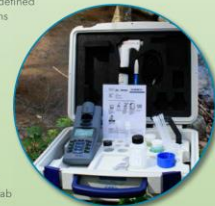
Field Sets: the mobile lab