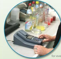
LabStation for even more comfort